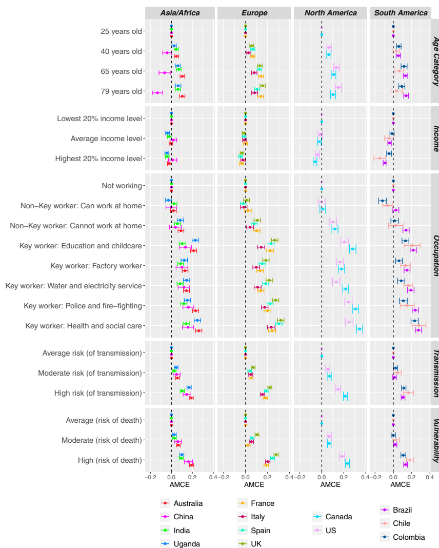
Fig. 2. Vaccine candidate decisions by country. AMCEs are reported for each attribute value. The 95% CIs are shown for each point estimate, clustered by subject. Models are weighted to reflect the respective national populations, excluding India and Uganda, which represent primarily urban samples.

correlations are suggestive; the public in weak-capacity states seem to be more enthusiastic about private provision than is the case in the higher-capacity states in our sample.