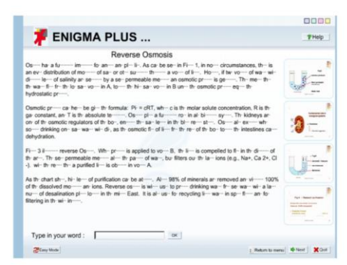
Fig. 2. Enigma plus e text screen.

Each answer entered by the user was recorded automatically onto a server. The entries were then downloaded from the server for a quantitative and statistical analysis. The findings presented here are from an authentic self-learning context without interference by an observer. The research questions were related to how users proceeded when reconstructing the text. Notably, do users take advantage of the possibility offered by the computer to work anywhere on the text or do they proceed in a linear fashion? Did the presence of certain words on the visual supports have an impact on the user entering, or not entering, the given word? What were the common types of mistakes or errors? And finally, did a series of "non hits" occur before users stopped reconstructing the text?